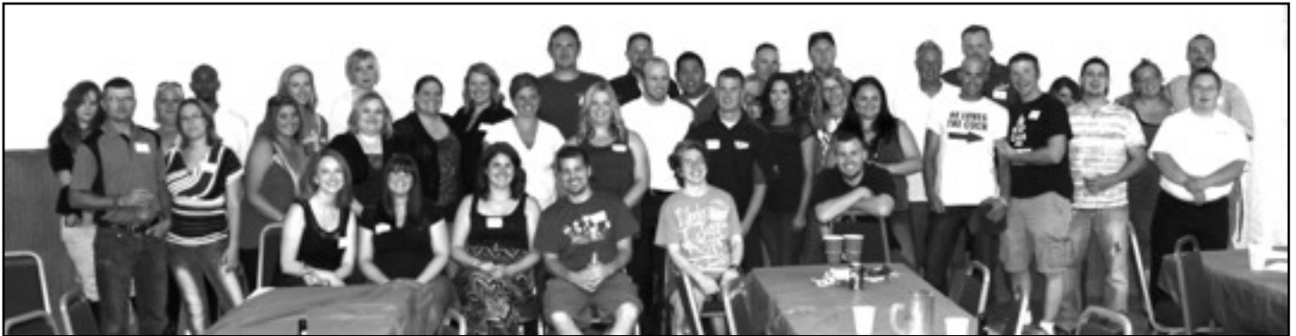
Class of 2004 10 Year Reunion

Please let us know of your upcoming class reunion. We'll post it on the website, and would be glad to stop in at your gathering with some interesting memorabilia from your years in school. Submit your reunion photo to our email, and we'll put you in the next Alumni Newsletter.