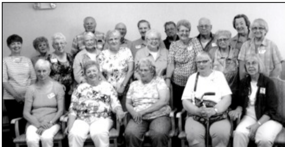
Class of 1957 57 year Reunion as the classmates turn 75