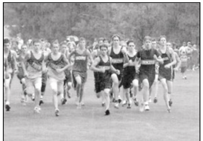
Cross Country invite, where the boys took 1st place