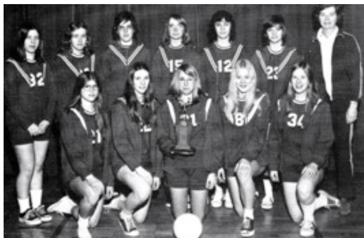
By 1974, girls had joined in the athletic action