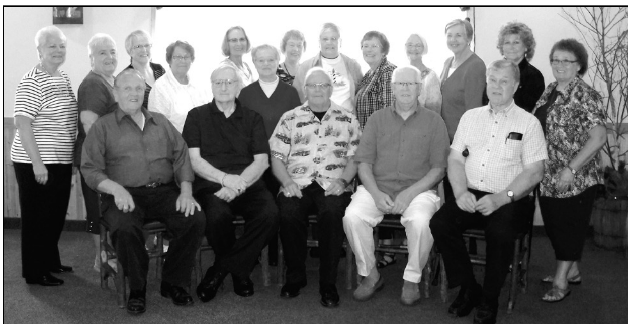
Class of 1960 - 55 year reunion