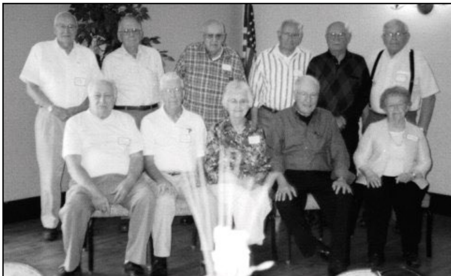
Class of 1950, 65th Reunion