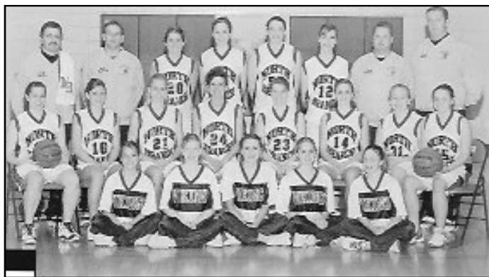
Varsity Girls Basketball 2006